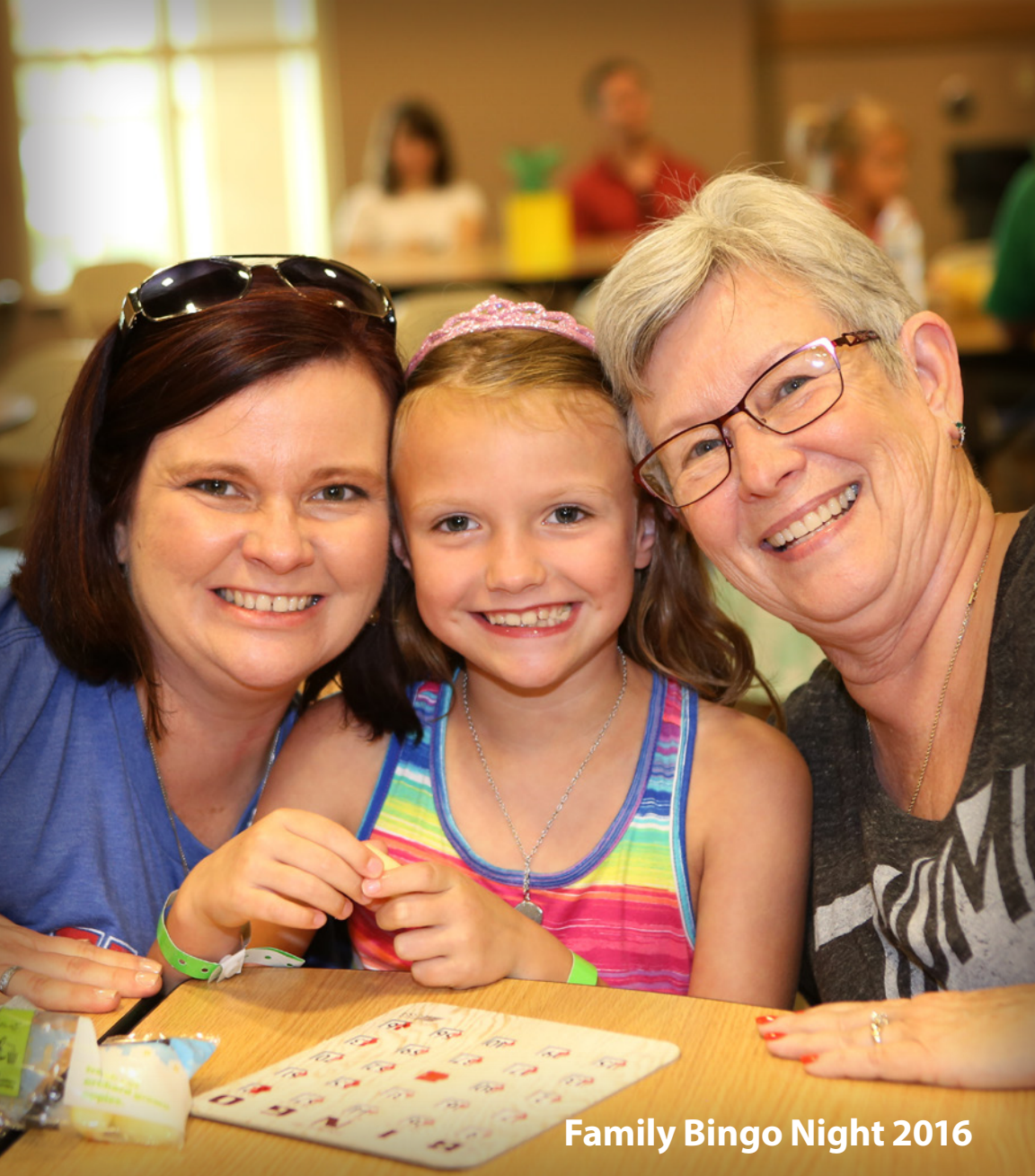
Family Bingo Night 2016