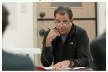
Make others feel welcome...